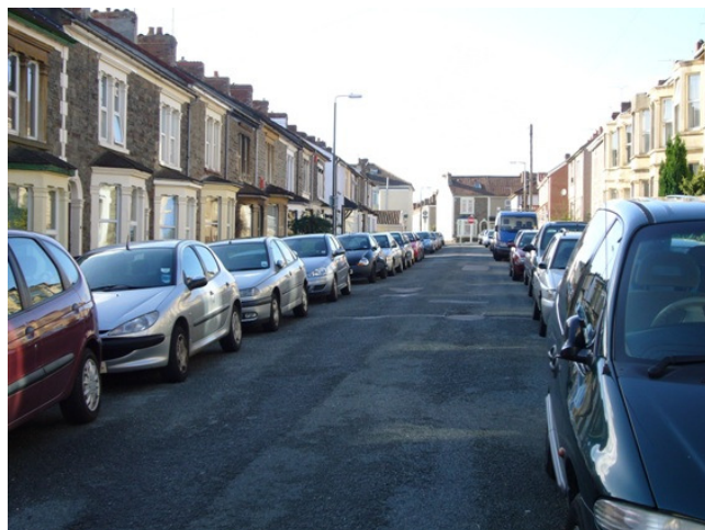
Laurel Street: One of a number of central Kingswood streets where residents experience parking problems

For a number of years we have been pressing the Council to consider extending the current residents' parking scheme on roads in the town centre. Currently the scheme is limited to South Road, West Street and parts of Cecil Road and Blackhorse Road , but other roads such as Laurel Street, Derrick Road, Bright Street, Halls Road, Moravian Road, Wood Road , parts of Hanham Road and the rest of Blackhorse Road suffer from a lack of on-street parking for local residents.